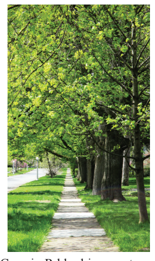
Corwin Rd looking west from Newcastle - still good

Dorchester Road* in the 1970s replacing the lost elm trees with a diversity of tree varieties in order to avoid in the future the loss of entire