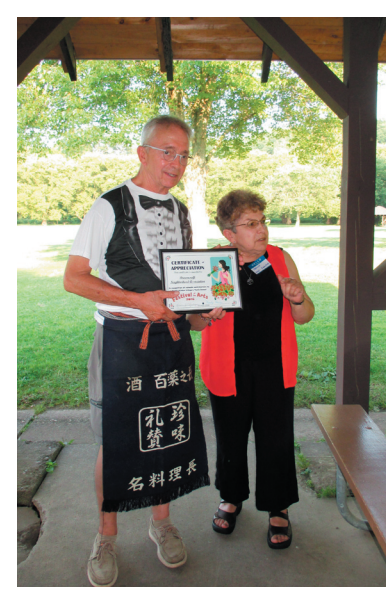
Accepting Award from NWV for Arts Festival Sponsoring