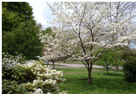
looking north across Browncroft to Rose Garden

It is spring in Browncroft and we are reminded of the beauty of our trees – both ornamental and shade -- bursting out and embrass-