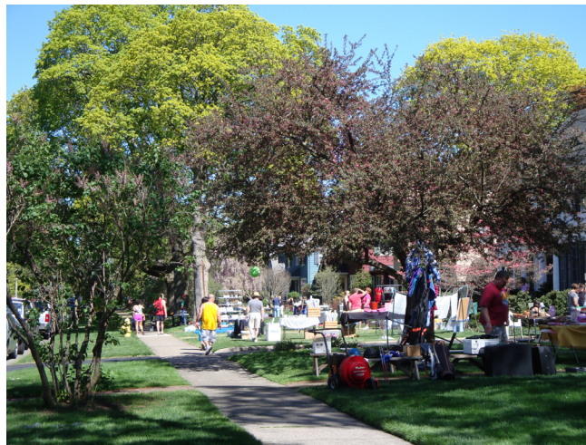
View looking east on Windemere Road