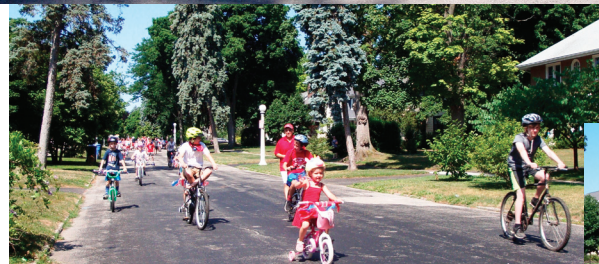
Some (little) people just have to be out front!