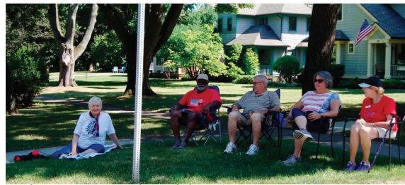
What's a parade without spectators?