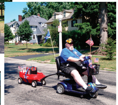
While the Music Man held up the rear.