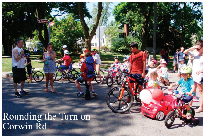
Rounding the Turn on Corwin Rd.