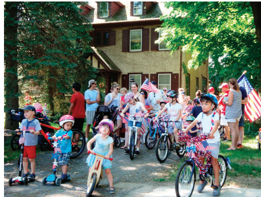
They're on their way now.