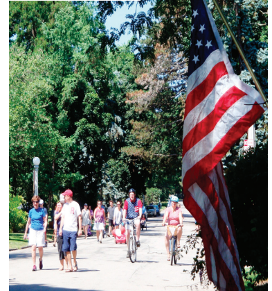
Grand Ole Flag on Windemere Rd.