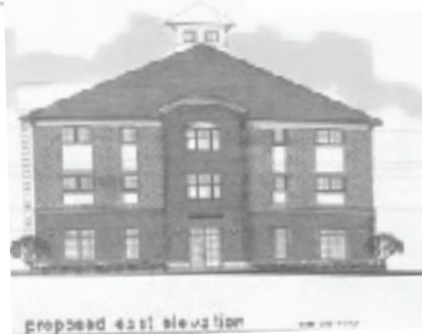
Elevation that will face Winton Rd.

There is a small building slated for behind the gas station, where Roly Door stood. The drawings show a structure with a drive through. This concept assumes a bank might occupy the space. Other alternatives mentioned were Starbucks and Jim's Restaurant.